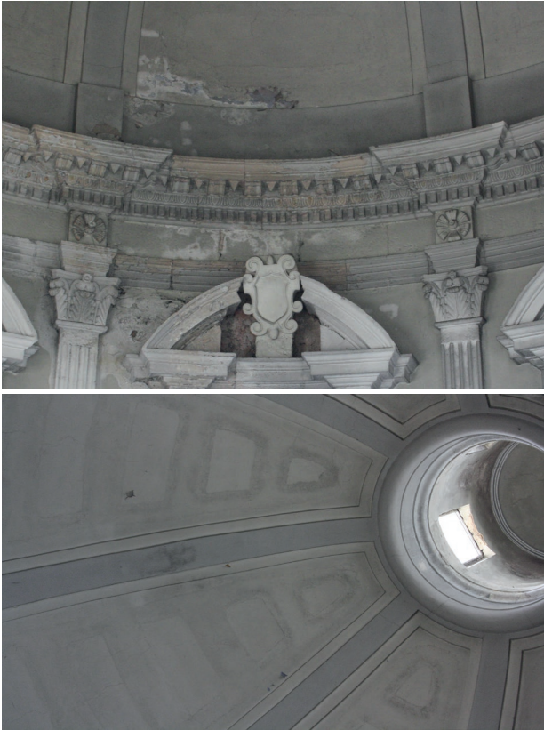
Figure 7 | Humidity patterns of the intrados, including infiltration efflorescence at the dome/drum connection (top) and condensation on the internal surfaces of the lantern (bottom).

patterns of the majolica shingles, in the form of missing elements, fracture of the elements - with regular or irregular breaking line - detachment of the vitreous coating, chromatic alteration and leaching (Fig. 8).