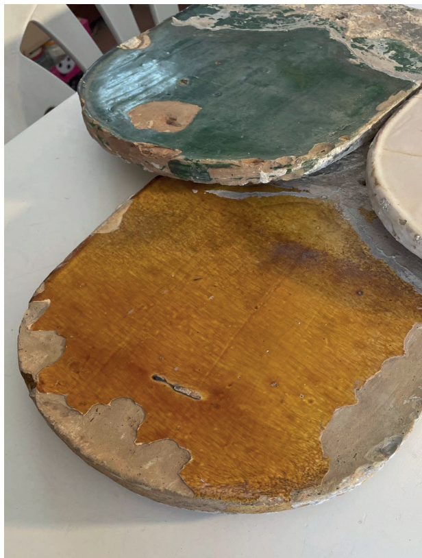
Figure 2 | Examples of Apulian majolica tiles.

glazes, which go from white to yellow, from green to light blue, from blue to brown, red and ochre (Zerlenga, 2021; Dell'Aquila, 1979). Moreover, in many cases, the shingles, placed on the dome top towards the lantern, are resized and tapered for correcting the optical perspective, while keeping the formal motif (Dell'Aquila, 1979, Gattuso, 2013).