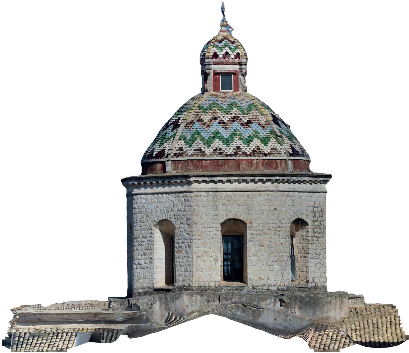
3D model of Apulian polychrome majolica dome.