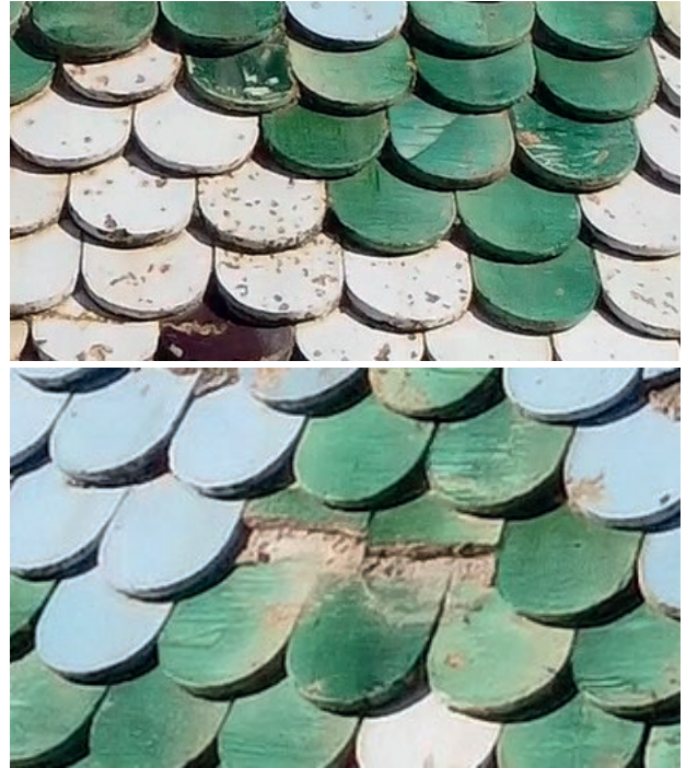
Figure 8 | Decay patterns of majolica shingles, including fracture, detachment of the vitreous coating and chromatic alteration.

Furthermore, the spatial distribution and deterioration effects of the humidity patterns resulted in the identification of two different, albeit concomitant, phenomena: infiltration humidity from rainwater, which passes through the masonry structures, in particular in