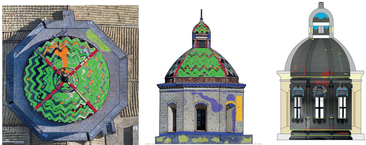
Figure 6 | Decay mapping, including internal cracks (green lines) and humidity patterns (light blue areas) and external missing elements (red), fracture of elements (purple), chromatic alteration (orange) and detachment of coating (light green).