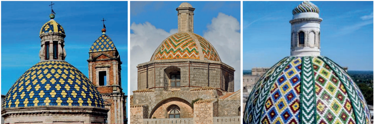
Figure 1 | Examples of Apulian majolica domes: (from top) Domes of Conversano, Oria and Ostuni.

of transformations occurred between the 17th and 19th centuries (de Cadilhac, 2018). Over the years, two territorial clusters are recognized, one in the North and the other in the South of the region. A possible explanation of these clusters is related to two seismic events. In particular, the earthquake of 30 July 1627 striking the Foggia area in the North and the event of 20 February 1743 occurred in the land of Otranto in the South (de Cadilhac, 2018). In both cases, the events profoundly marked the territory and the environment hosting these architectures and they triggered the need for reconstruction with novel solutions meeting both aesthetic and functional needs (Capone, 2022). The trinomial “needs, requirements and performances”, cornerstone of the technical architecture and building engineering, finds an excellent synthesis then, since the different use of a known material to cover the domes responded to an economic need (the majolica tiles were certainly less expensive and therefore most used in the past), stood out for its distinctive artistic-architectural connotation of splendour and power and rationally resolved the waterproofing of the extrados after post-seismic structural consolidation works (de Cadilhac, 2018; Picone, 2020).