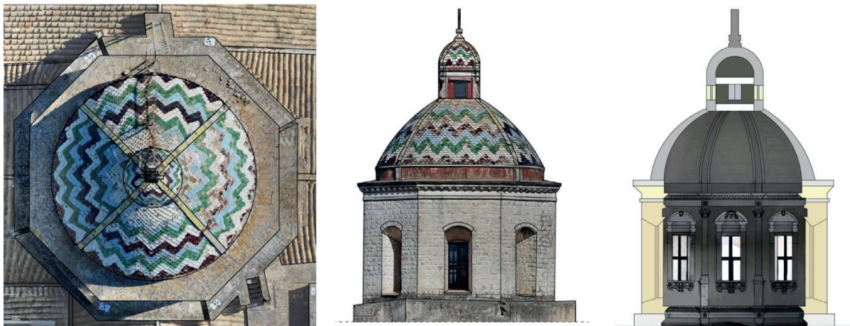
Figure 5 | Orthoimages.