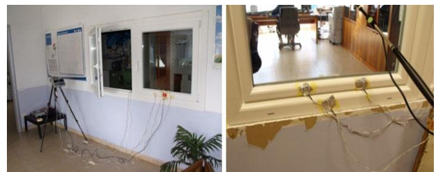
Figure 1. Example of frame measured

In the situ campaign, at the University of Basilicata-Matera, we measured the surface temperatures and heat flux on window frame system made in PVC. The system was mounted on a partition wall between two rooms, which were air-conditioned achieving a constant thermal difference of about 7 ° C, Figure 1.