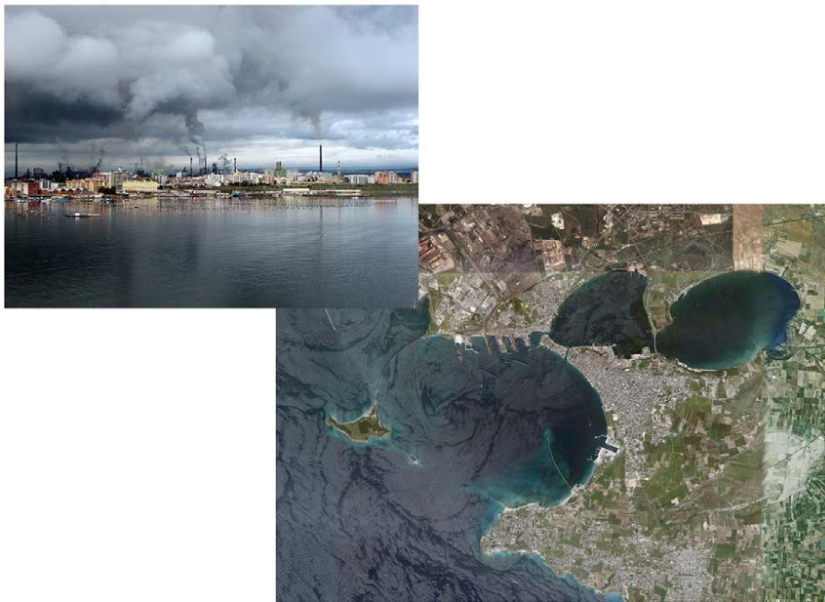
Fig. 1 The Taranto case study

The experimental context of the present work of ontological analysis of places is the making of Taranto (Italy) strategic plan, oriented to 2065. Data were collected via a series of nine community-based, interactive processes of knowledge exchange, aimed at building future scenarios for the new plan. The interactive processes of knowledge exchange were carried out in Taranto, southern Italy during spring and summer in 2014. They were carried out to support policies and decisions on urban socioeconomic as well as environmental domains and organized as a sequence of face-to-face brainstorming forums aimed at cooperatively singling out strategic lines to build alternative development scenarios. From a methodological point of view, it was a 2-step scenario-building activity (Khakee et al., 2002). First, agents were invited to report problems they faced in their town districts. Then, each agent was invited to generate a reflection about the future of the district, particularly concerning expectations of future changes. Such sessions were organized in all town districts, indoor or outdoor, with participants divided in groups each of them sitting around a dedicated desk. A municipal representative coordinated each desk without taking part in the generative session, she/he had only the task of transcribing in linear charts concerns, problems, expectations and desires presented by the participants at the desk.